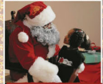
Santa & His Helpers