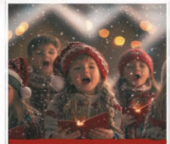
Carolers & More....