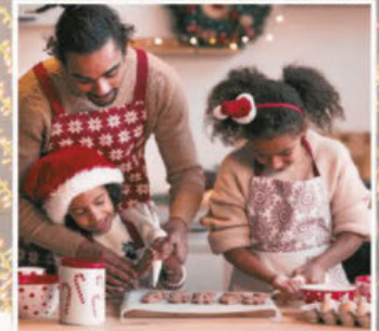
Holiday Decor Stations